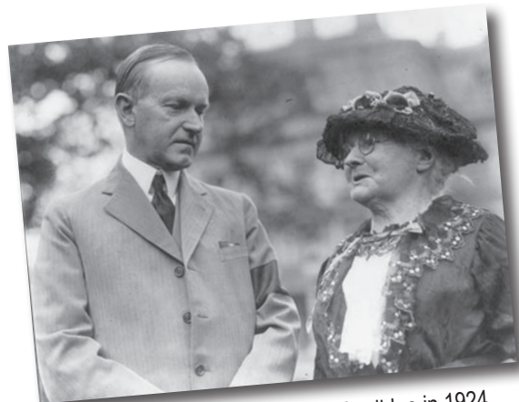
Mother Jones & President Calvin Coolidge in 1924

The Cork Mother Jones Committee wish to thank our speakers, musicians, singers, participants, film makers, sponsors, and volunteers who working together create a unique festival to honour Cork’s Rebel Daughter.